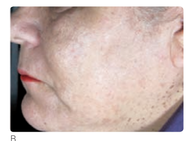
Dermatosis papulosa Nigra.