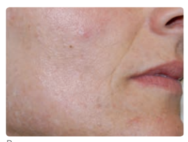
Combined scars treatment with DOT + RF.